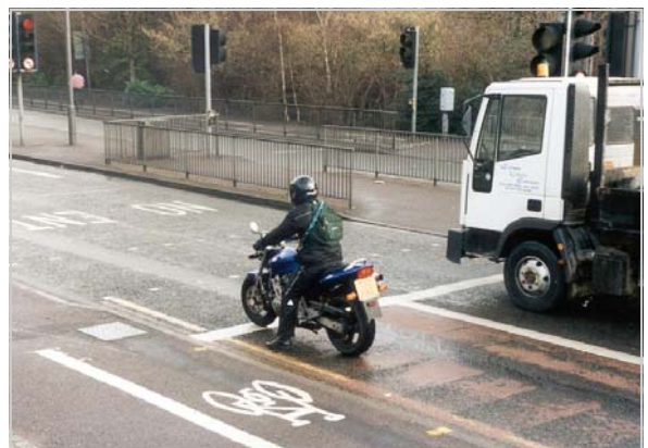
Bikes Getting More Access to Bus Lanes

Since 2003, MCI has been working with Transport for London (TfL) on an experimental scheme to allow access to bus lanes on certain London routes. The scheme resulted in a TfL report which contained good news about the initiative, with safety benefits noted among all road user groups, including cyclists, if motorcycles were allowed access to bus lanes.