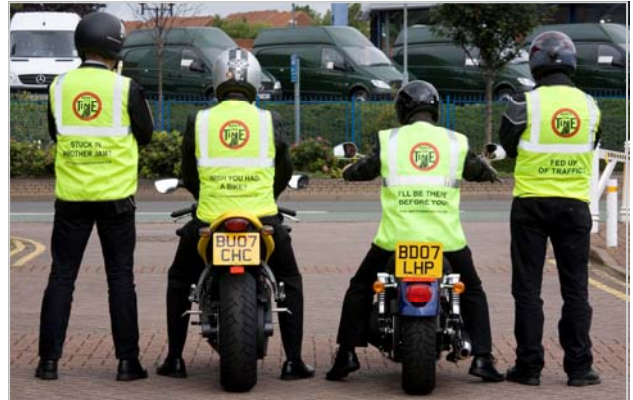
Bike Squads Say Yes to Two Wheels

In 2008, the NTT campaign reinforced the key themes of 2007, but as the deadline for the new test approaches, the campaign is evolving to provide a more generic message about the benefits of biking to the non motorcycling public.