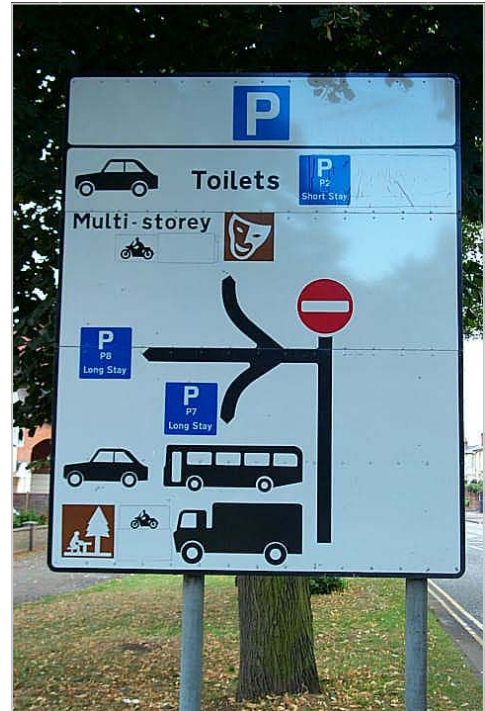
Challenging confusing road signs can help improve road safety

Within these core areas is a programme of activities aimed at the main political institutions and other public and private organisations. MCI is also replicating some of this activity with our European partners at ACEM (European industry) level.